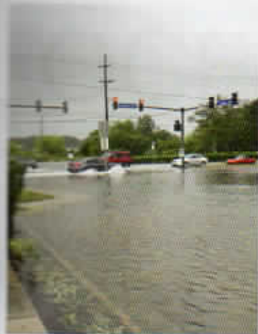
Front cover: Coastal flooding is of growing concern across Tidewater Virginia and in other coastal areas worldwide. Photo depicts flooding resulting from 2016 Hurricane Hermine in front of Norfolk's Larchmont Library at the intersection of Hampton Blvd. and Laxon Ave. on 9/3/2016 at 10:30 am EDT.

Guest Editors: Ray Toll and Gerhard F. Kuska