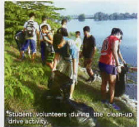
Student volunteers during the clean-up drive activity.

Be a part of the solution, not part of the problem. If you won't, who will?" added Ms. Belencion. 🐦